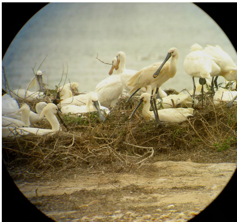
Figure 3. A colour-ringed bird born on Terschelling in 1997 standing on its nest on Nair (Banc d'Arguin) on 17 May 2010. A month later it was observed feeding chicks. Its partner (sitting on the nest) has a yellow bill tip. Given that male spoonbills generally have larger bills than females, the standing bird is probably a male.

studies on avian subspecies. A sample of studies on migrant bird species, although generally using slightly smaller sets of microsatellite loci, showed rather comparable levels of differentiation; in order of increasing F_{ST} : Dunlin Calidris alpina (three subspecies, 7 loci, F_{ST} \leq 0.010 ; Marthinsen et al. 2007), Canada Goose Branta canadensis (two subspecies, 6 loci, F_{ST} = 0.021 ; Mylecraine et al. 2008), Bluethroat Luscinia svecica (seven subspecies, 7–11 loci, F_{ST} = 0.042 ; Johnsen et al. 2006), Reed Bunting Emberiza schoeniclus (two subspecies, 6 loci, F_{ST} = 0.043 ; Kvist et al. 2011), and Piping Plover Charadrius melodus (two subspecies, 8 loci, F_{ST} = 0.104 ; Miller et al. 2010). Thus, with F_{ST} = 0.063 , the observed genetic differentiation between the two Spoonbill subspecies seems to fall in the upper range of values. On the basis of this comparison the subspecies status of balsaci seems entirely valid.