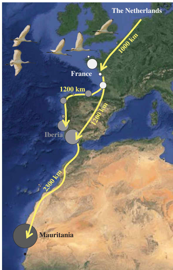
Figure 1. Map of spoonbill migration system. The sizes of the dots represent the number of individuals in the analysis that wintered at each site. (Online version in colour.)

mortality rates. This paucity of studies is easily explained by the difficulty of following individual birds throughout their annual cycle. Although some studies compared annual survival of individuals or populations with varying migration distances [11,12], estimating annual survival is not appropriate for measuring the cost of migration; the mortality cost of migration may be outweighed by the survival benefits of wintering further away from the breeding grounds [13]. For a proper assessment of the mortality cost of migration, we need to compare mortality during migratory and stationary periods of individuals with varying migration distances, while keeping constant as many other variables as possible.